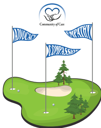
Our "ACE" in the hole

Community of Care provides Advocacy, Compassion and Empathy so older adults feel respected and remain in their homes as long as safely possible (our ACE in the hole).