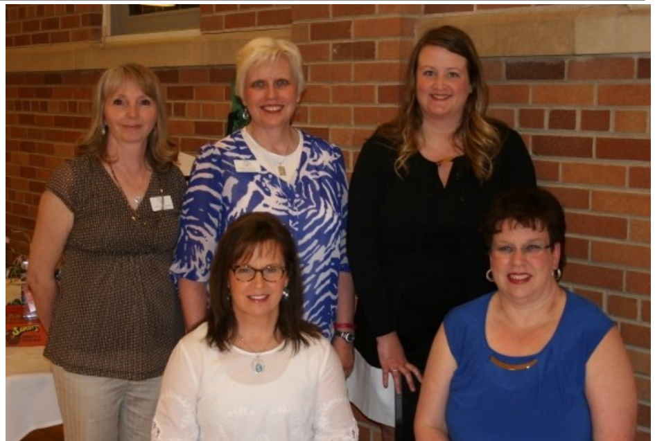
Community of Care Staff—2015