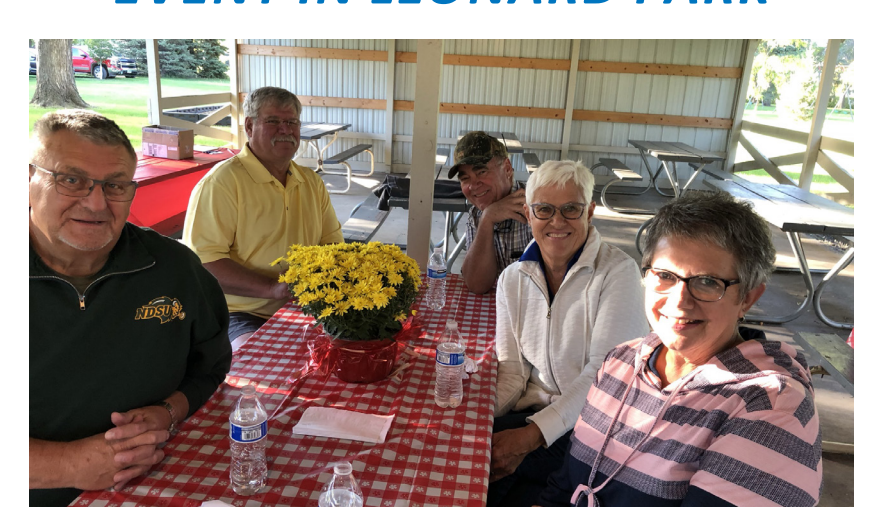
THANK YOU TO ALL OUR VOLUNTEERS! WE COULD NOT PROVIDE THE SERVICES WE DO WITHOUT YOU.