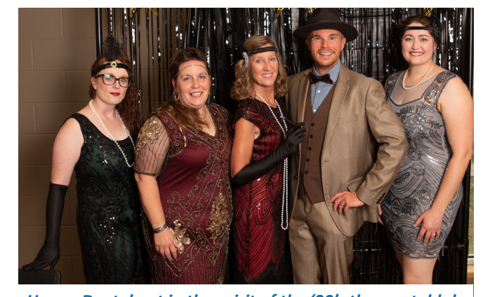
Hagen Dental got in the spirit of the '20's themes table!