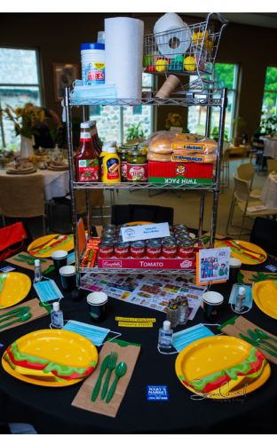
Most Creative -Mary's Market