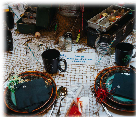
People’s Choice Winner & Most Creative — Buffalo Creek Equipment