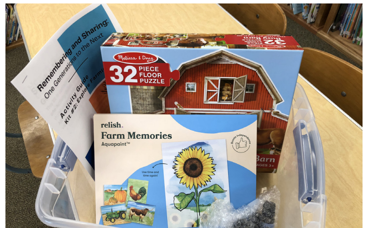
Farming/Gardening Memory Box