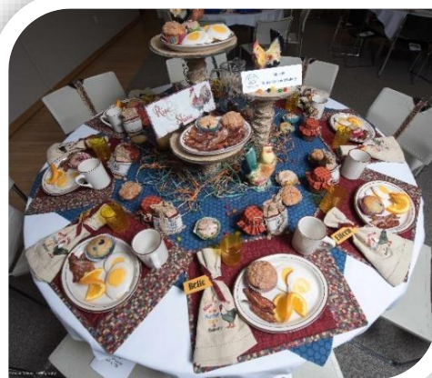
2016 Peoples' Choice Winner – Hunter Cafe

Medicare Part D drug plan enrollment continues through December 7 th . Call our office to set up your appointment – 701/347-0032. We encourage everyone 65 and older to review their Part D plan every year.